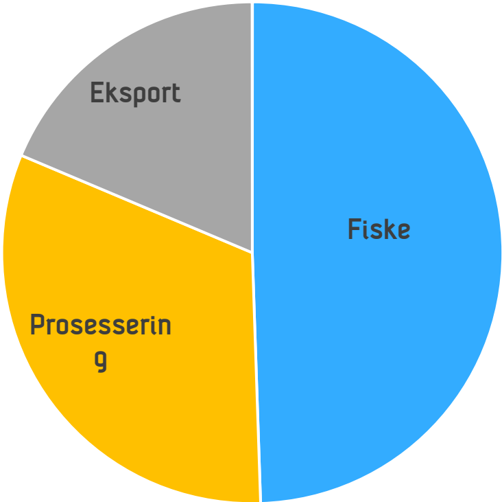
Carbon footprint fished products